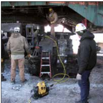
◀ Any brand of hydraulic torque wrench can be powered by the portable ZU4T-Series torque wrench pump.